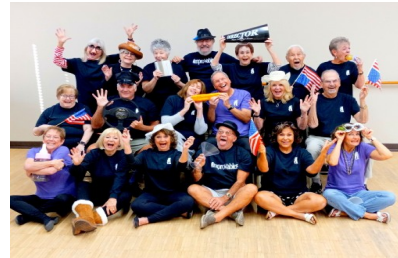
The ImproVables Gang

We are so excited that our February 5 th show was sold out! Tickets went on sale Jan. 3 rd , and 5 days later we were completely sold out! We had an audience of 100 people.