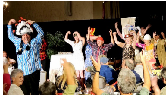
During A Performance Of Dealt A Deadly Hand