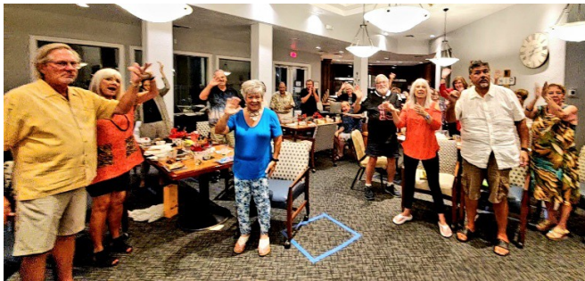
Dealt A Deadly Hand Cast Party

We are so grateful all these new members chose SLCT. Many have commented about the sense of family and fun they have already found. Don't let the opportunity pass with someone who may be interested in joining SLCT.... Encourage them attend the next General Meeting or have them visit us at www.slctinfo.com for membership information.