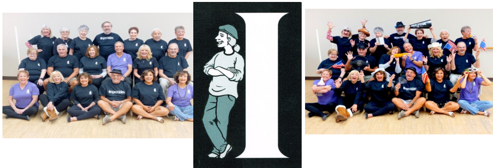
The ImproVables Gang

The (revived) ImproVables are winding up a very successful first year! After a hit and sold out show at Sun Lakes Country Club, the comedy group performed for another sold out audience at Cottonwood on April 22.